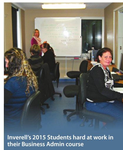
Inverell's 2015 Students hard at work in their Business Admin course

Cost: Refer to student fee table on page 6