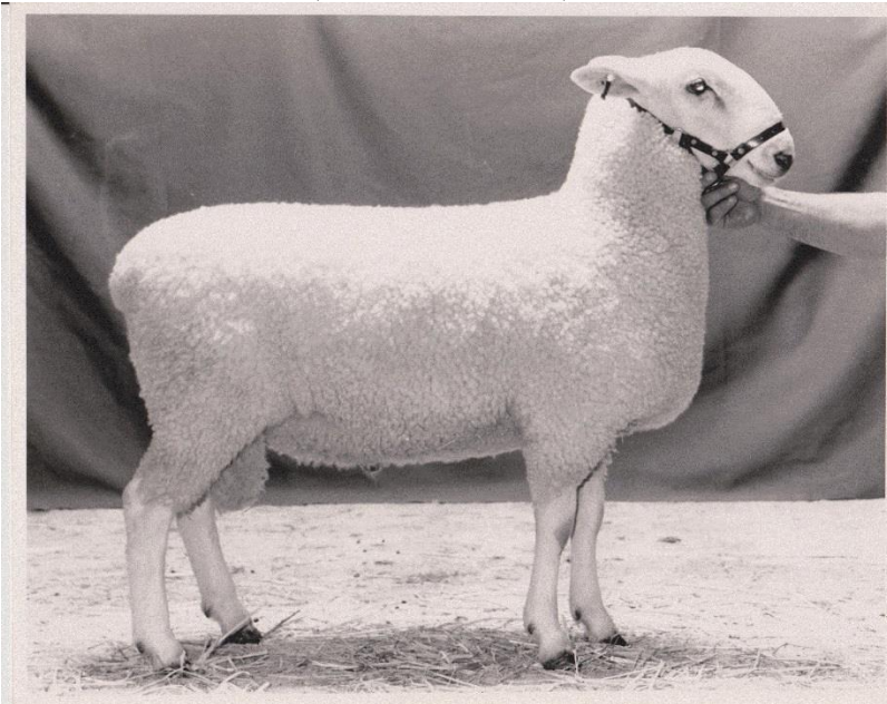
DUENCLIN "SHORNWHITE" 130-87 AT ADELAIDE SHOW WHERE HE WON SHORN RAM CLASS IN1988. (SUPREME ALL-BREEDS THE NEXT YEAR AS 4 TOOTH)

From Kaniva turn South West at the roundabout and travel 11 km out the South Lillimur Rd. Turn left onto a sandstone road (D Hawkers Rd) after the reserve on the hill, and left again immediately down 3 Chain Rd. Approximately 3 km East on 3 Chain Rd turn South down Huxtable Rd. Follow the track through to the shed. NOTE: The dotted line is a black formation (DRY WEATHER ONLY) road.