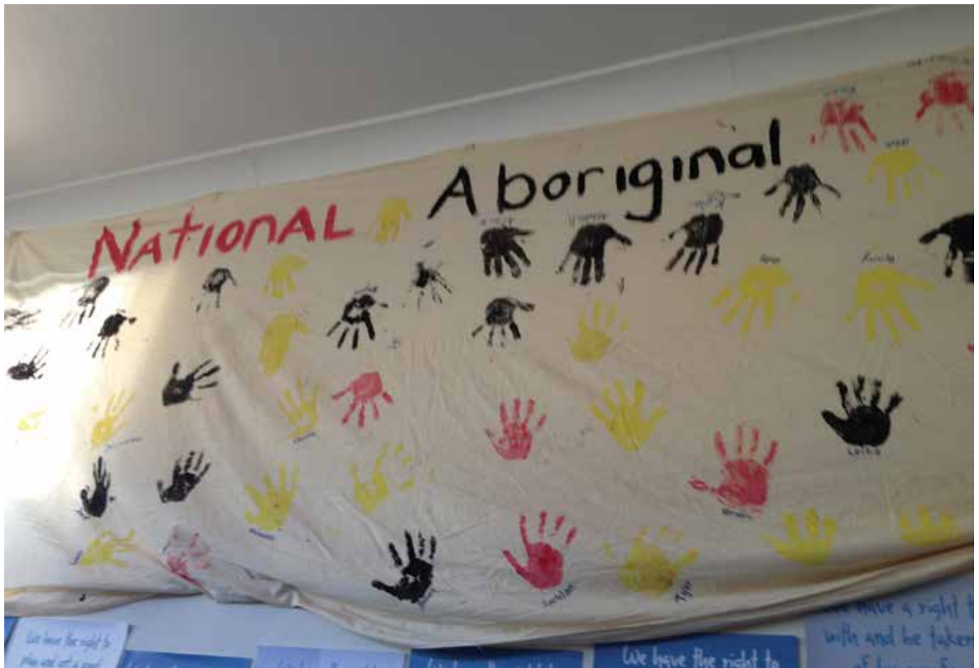
Student artwork - Yalmambirra Learning centre, Wellington