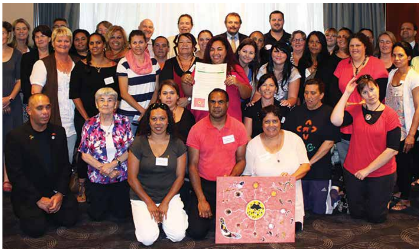
Barnardos Australia Reconciliation Statement Signing Ceremony 2012

*When the term Aboriginal is used this may also include Torres Strait Islander people. The full term of Aboriginal and Torres Strait Islander people will be written where it is important to acknowledge the very distinctive and unique cultures.