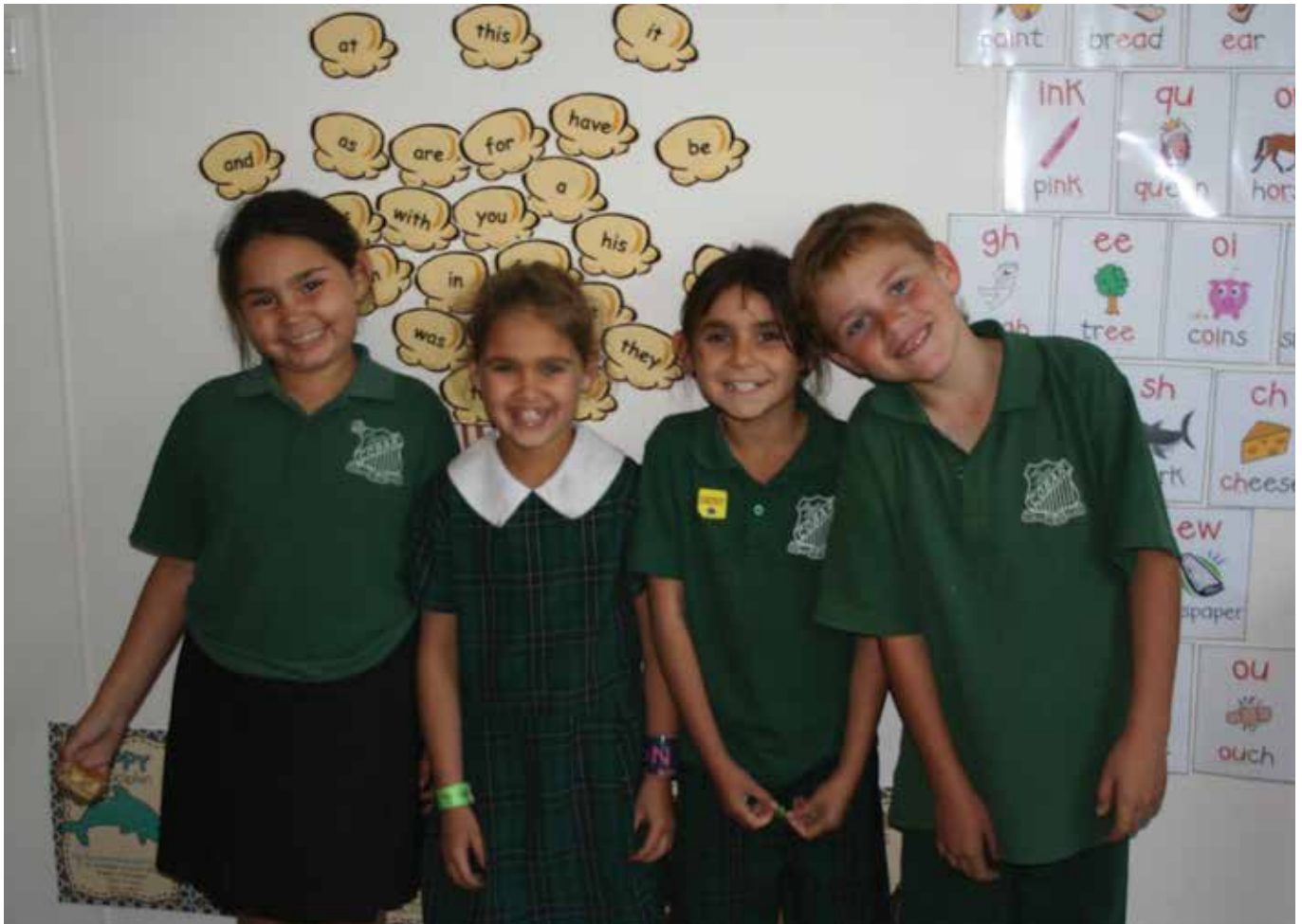
Barnardos Cobar Learning Centre