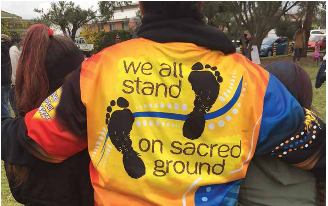
Barnardos South Coast Centre's NAIDOC Week Celebrations 2015