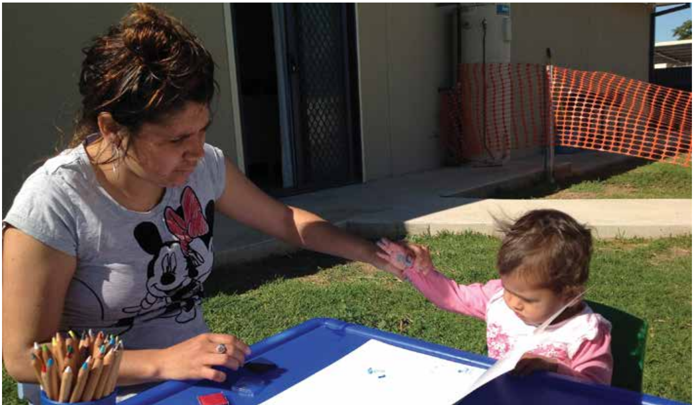
Parents as Teachers Program, Barnardos Nyngan centre, 2015