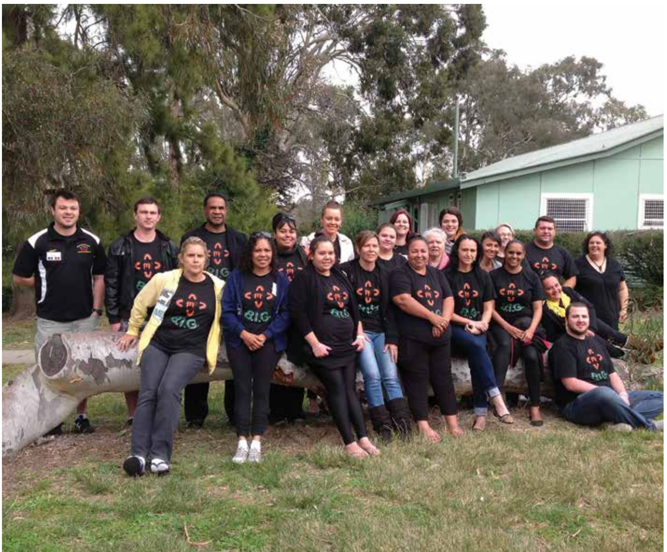
BIG - Barnardos Indigenous Group representatives (2013)