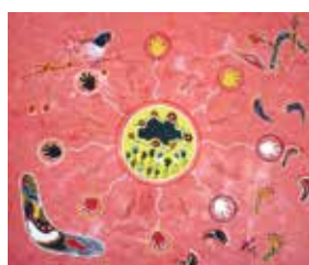
Seek, Reach, and Solve Wiradjuri Ngaaga-Marra-Marra

The painting depicts Workers reaching out into the communities near and far lending a helping hand trying to reconcile families.