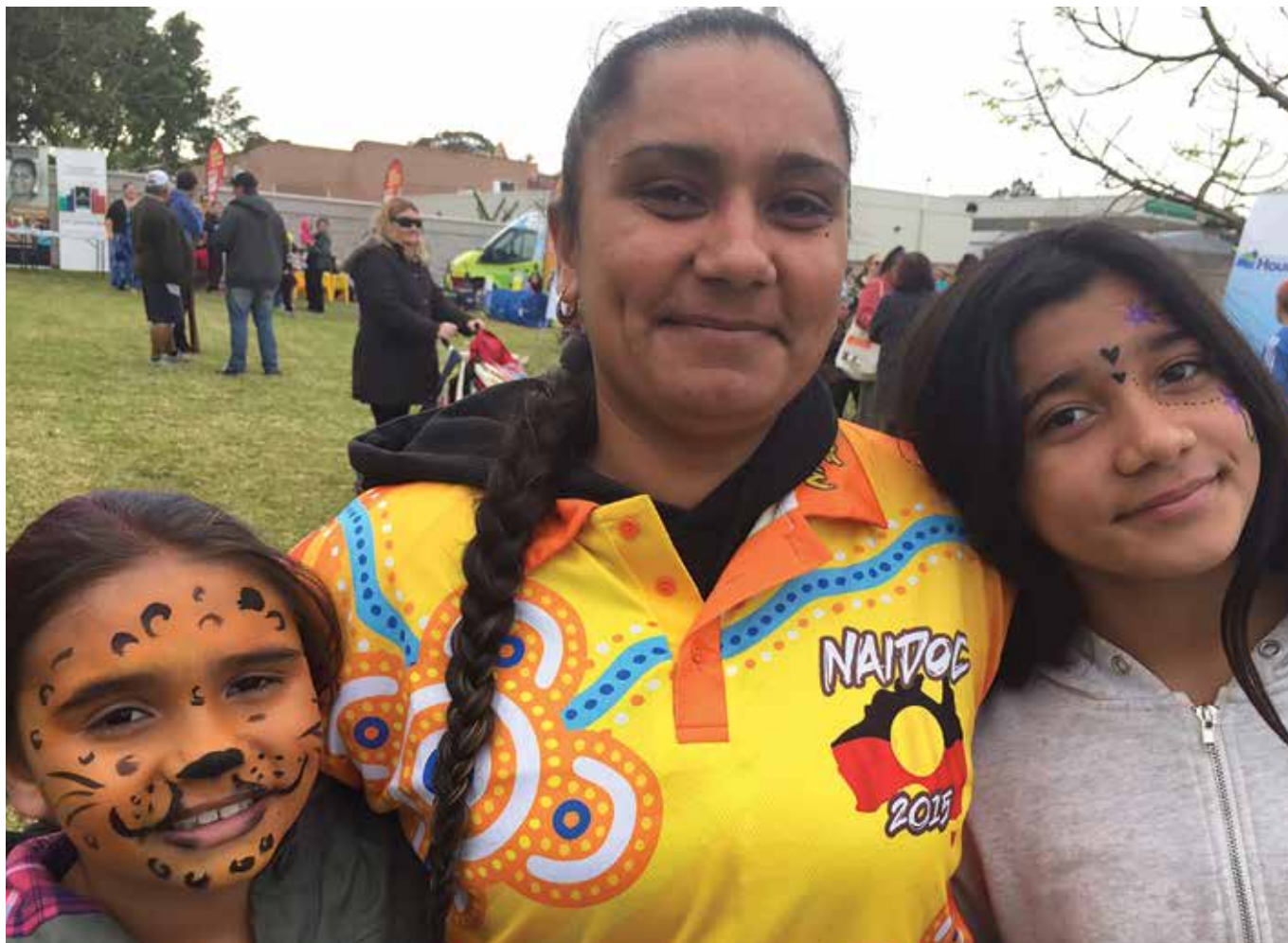
Barnardos South Coast Centre's NAIDOC Week Celebrations 2015

Barnardos Australia's Reconciliation Statement was officially endorsed by the Barnardos Chair on the 31st October 2012. This statement was produced by BIG or Barnardos Indigenous Group, our agency's representative group of Aboriginal and Torres Strait Islander staff, after extensive consultation across the agency. The Reconciliation Statement is consistent with Barnardos' vision and organisational strategy, being a practical statement of how the agency will work with Aboriginal and Torres Strait Islander children, young people, their families and communities to meet their needs and achieve 'generations of success'.