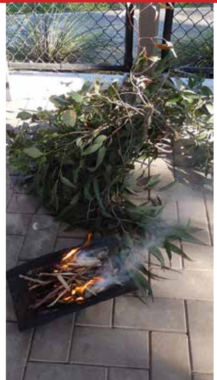
NAIDOC day celebrations at Barnardos Penrith Centre 2014