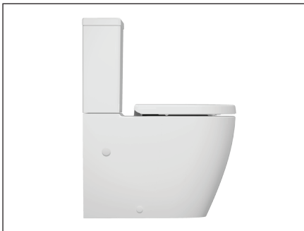
Bottom inlet version of pan pictured

Combining universal design with rimless pan technology, the Urbane Cleanflush™ is a superior flushing system suitable for domestic and commercial applications. Incorporating several patented technologies: Caroma Flow Splitter™, Caroma Flow Balancer™ and Caroma Uni-Orbital® Connector, the Cleanflush pan is innovative and the next evolution in toilets. The Flow Splitter evenly flows water around the top of the bowl to meet at the Flow Balancer which directs the water powerfully into the sump, reducing the need for brush cleaning. The rimless pan is easy to clean and unlike traditional pan profiles, provides full visibility of any grime build up. Caroma Cleanflush provides a cleaner clean for peace of mind.