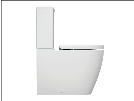
Back entry version of pan pictured